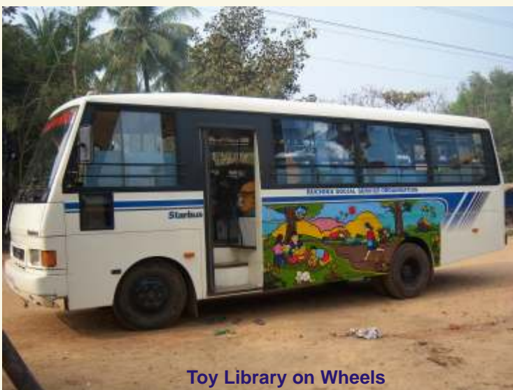
Toy Library on Wheels