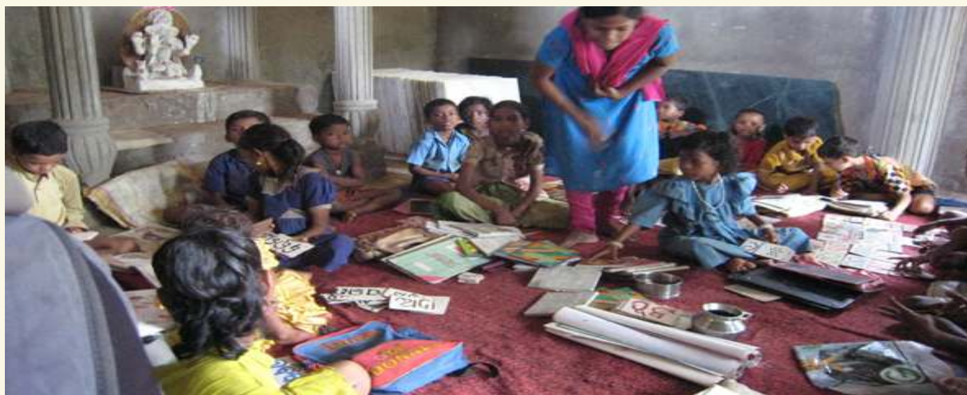
23 YEARS OF DEDICATION TO GIVE THE CHILDREN AN OPPORTUNITY TO SMILE